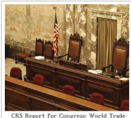
CRS Report for Congress: World Trade Organization Negotiations: The Doha Development Agenda: January 3, 2007 -RL32060